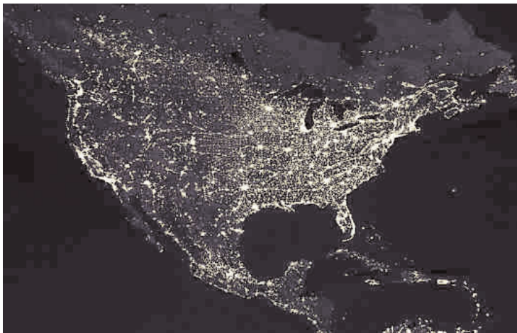
This NASA photograph reveals evening lighting in the U.S. and its neighbors, much of it from arc plasma lamps. The light from those lamps may signal our presence to alien civilizations.

Light production is important for our economy. As of the early 1990s light production in the U.S. accounted directly for about 20% of electrical energy use. That number increases to about 33% if we include the additional electricity required for air cooling to remove heat generated by lamps. With electricity accounting for about 40% of the energy used in the U.S., lighting is indeed a significant factor in the nation's overall energy consumption. Clearly it is important to develop lamps that are more energy-efficient, and the lighting industry is working on this. Moreover, the future also promises to bring new and improved types of plasma-based lamps, including better compact fluorescent lamps, more electrodeless lamps (powered indirectly rather than with wires connected to internal electrodes), and lamps with less or no mercury.